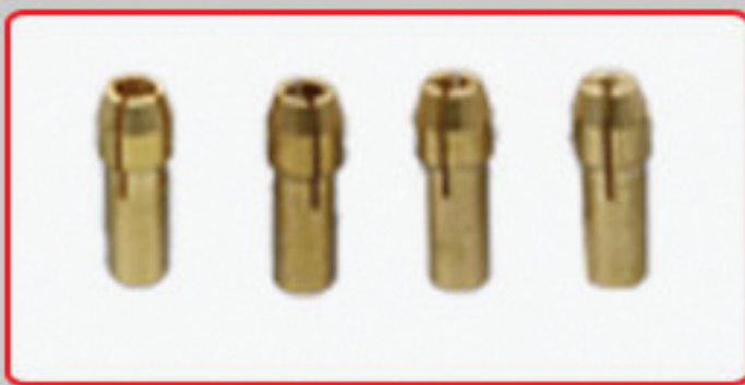
Collet Attachments of different size for mandrels and drills.