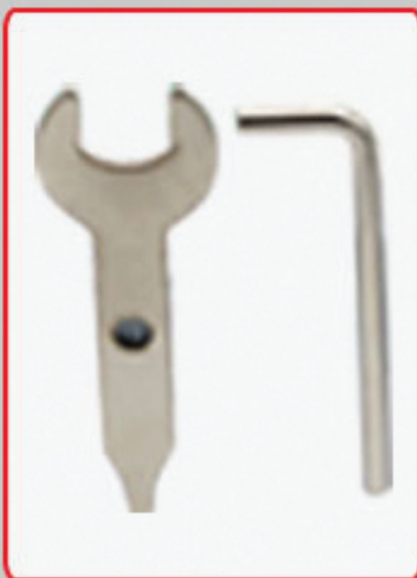
Spanner & Key

For more products & updates, follow us on: