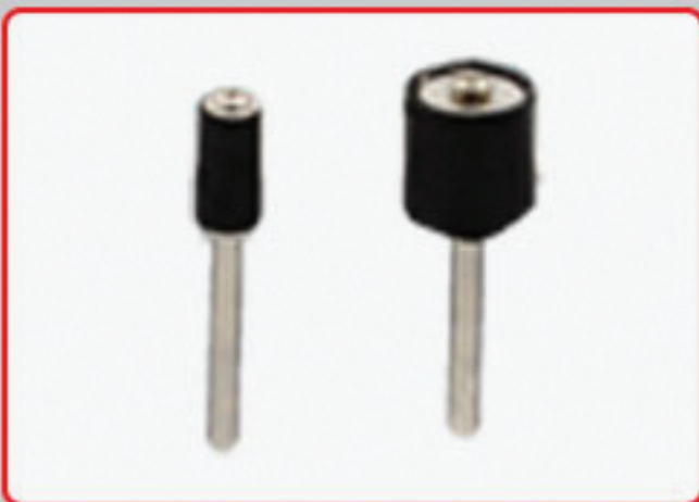
Sanding Drum Mandrels

Rotary Burs are used for carving, engraving, routing, shaping in fiberglass, plastic, wood and soft metals like copper, brass, aluminum.